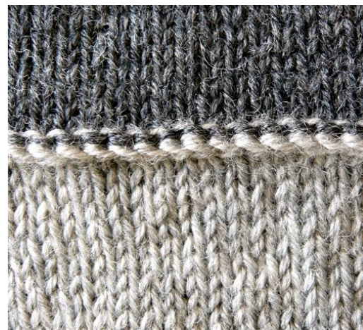
The 3-needle-BO join (bound off with light grey)

BO with a 3rd needles as for Left Front. Pull yarn through.